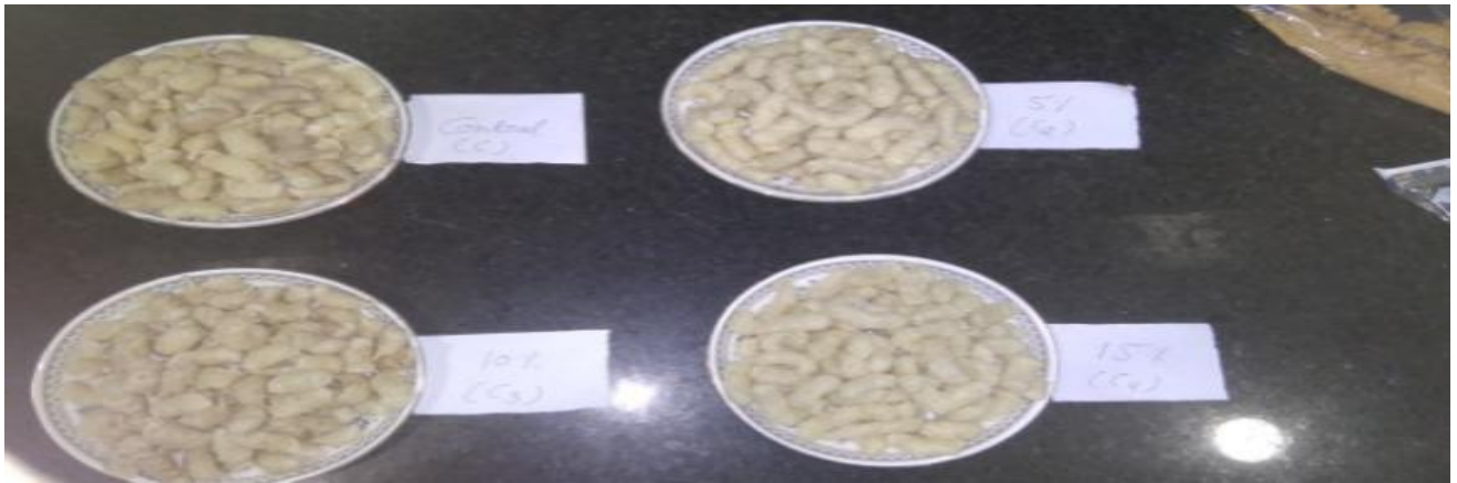
Fig. 1 : Extruded puff products, (C=Control, C1=5%, C2=10%, C3=15% SPI blended samples